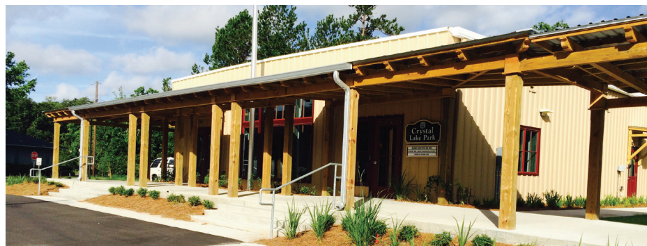
Moving to the new office located at 124 Lady's Island Drive on June 12, 2017.